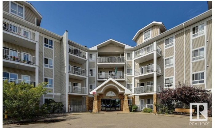
328-5350 199 St NW, Edmonton, AB