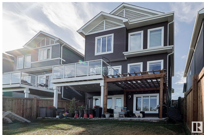
880 Ebbers Cres NW, Edmonton, AB