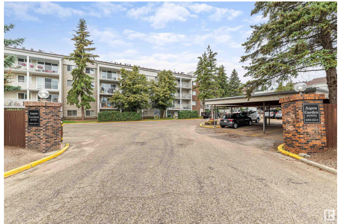
401-4404 122 St NW, Edmonton, AB